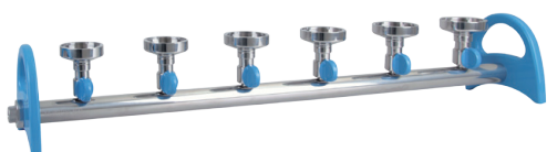
MultiVac 600 - MB 6 Places Stainless Steel Manifold (180600-02)