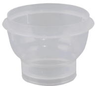
Sartorius, 100 ml disposable plastic funnel (16A07)

Step 2. Choose the disposable funnel and adaptor