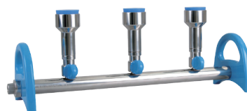
MultiVac 300 - MS 3 Places Stainless Steel Manifold (180300-01)