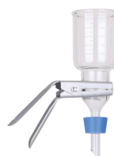
Rocker, 300 ml VF6, Glass Filter Holder (167120-31)