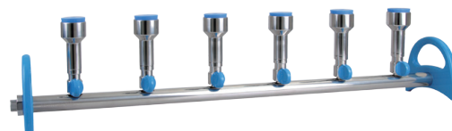
MultiVac 600 - MS 6 Places Stainless Steel Manifold (180600-01)