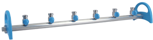
MultiVac 600 6 Places Stainless Steel Manifold Base (180600-00)