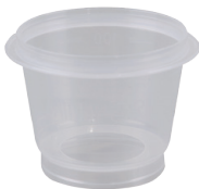
Millipore, 100 ml / 250 ml Microfil, disposable plastic funnel (MIACFD101 / MIACFD201)